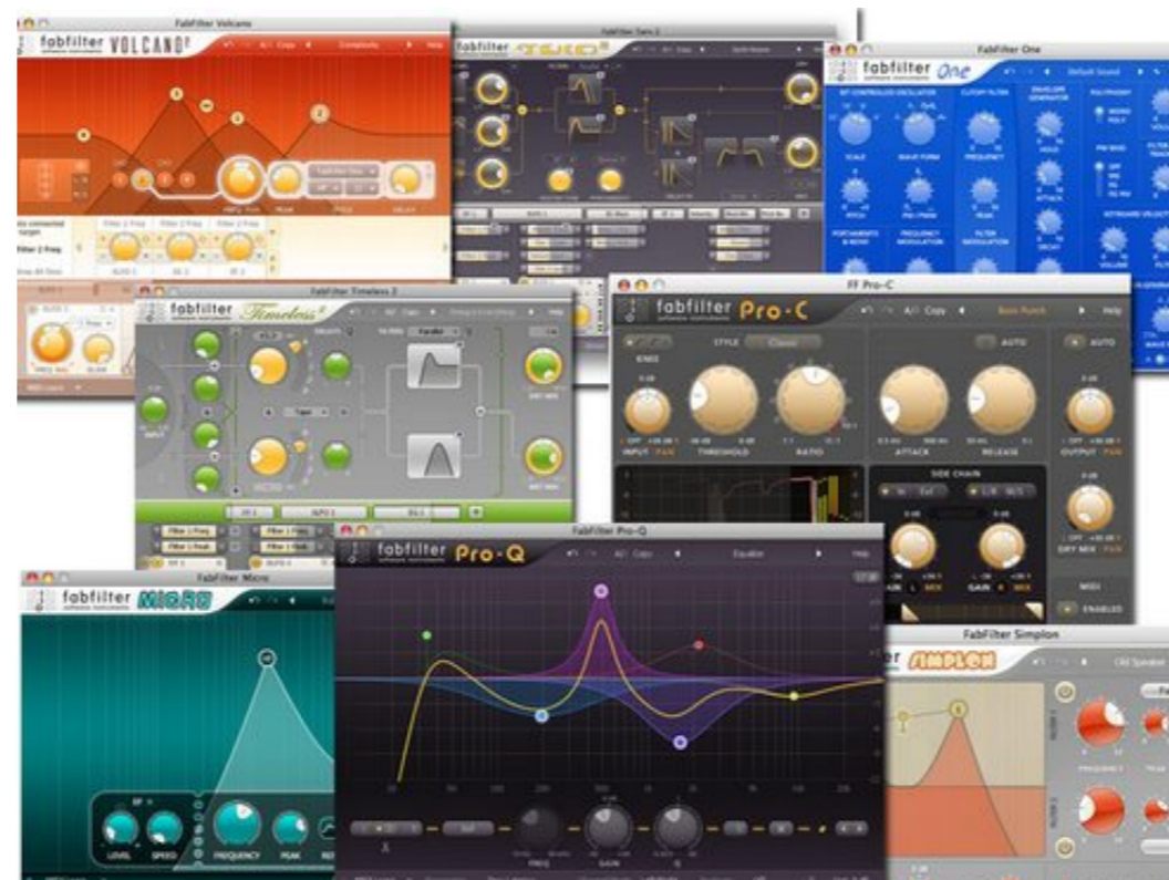
Fabfilter Total Bundle X64 Torrent